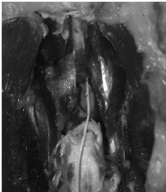
Figure 2. Necropsy dissection of the intravertebral space L7-S1 showing catheter entering the intrathecal space.

A summary of the spinal histopathology for all the sheep in these studies are presented in Table 2. At high dosing levels all of the agents studied statistically differed from dose level 2 and lower in regard to the presence of inflammatory cells and necrosis ( U = 31 , p < 0.001 and U = 23 , p < 0.001 , respectively; U = Mann-Whitney U statistic). The occur-